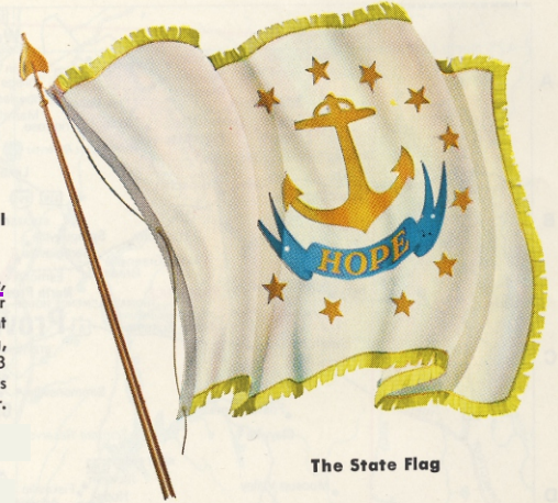
The State Flag

Symbols of Rhode Island. On the seal, the state motto, Hope , is printed above an anchor, a symbol of hope. The date is the year Roger Williams founded Providence, the state's first permanent white settlement. The seal was adopted in 1875. The state flag, adopted in 1877, has 13 gold stars that represent the 13 original colonies. The white field symbolizes the white uniforms worn by Rhode Island soldiers during the Revolutionary War.