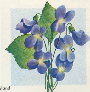
The State Flower Violet

The State Capital is in Providence, the capital of Rhode Island since 1900. Earlier capitals were Newport, East Greenwich, Bristol, South Kingstown, and Providence (at the same time, 1663-1854); and Newport and Providence (at the same time, 1854-1900). Rhode Island Development Council