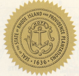
The State Seal